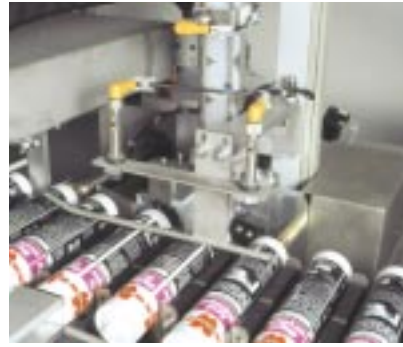
Prisma Chain, Filling and Plunger Insertion